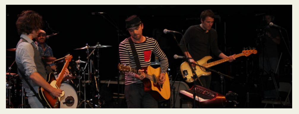
Celebrating 10 Years of Music and Community